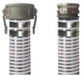
Camlock C X E