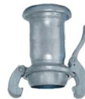
Female Socket x Male Ball Increaser