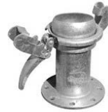
Male Ball x ANSI Flange Reducers