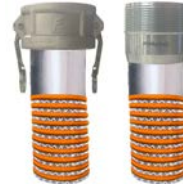
Camlock C X NPT