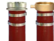
NPSH M x F