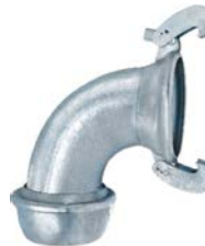
Male Ball x Female Socket 90°