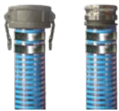
Camlock C X E