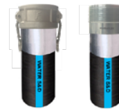
Camlock CX NPT