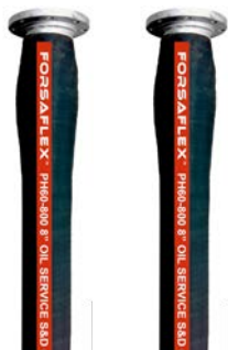
Floating x Floating