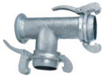
Inline T with Male Branch