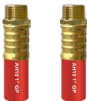
NPT x NPT