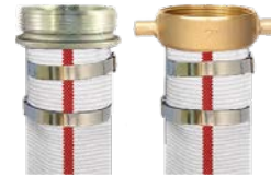
NPSH M x F