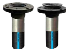
Fixed x Floating