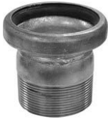
Female Socket x Male NPT