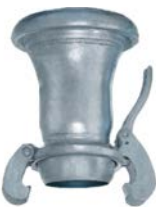
Female Socket x Male Ball Reducer