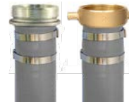
NPSH M x F