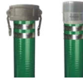
Camlock C x NPT