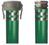
Camlock C X E