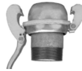
Male Ball x Male NPT