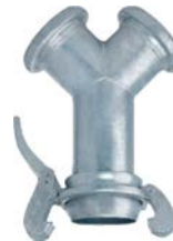
Double Female Socket - Y