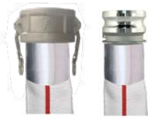
Camlock C X E