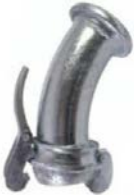
Male Ball x Female Socket 45°