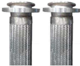
Floating x Floating