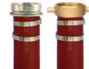
NPSH M x F