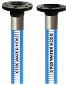
Fixed x Floating