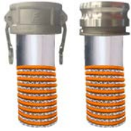
Camlock C X E