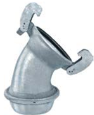
Male Ball x Female Socket 45°