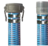
Camlock C x NPT