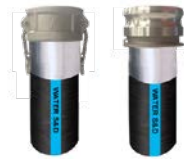
Camlock CX E