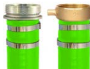
NPSH M x F