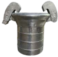
Female Socket x Shank