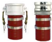
Camlock C X E