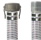
Camlock C x NPT