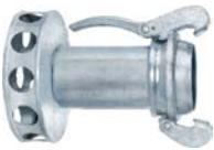
Male Ball x Round Hole Strainer