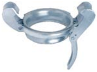
Bauer Locking Lever