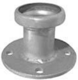
Female Socket x ANSI Flange