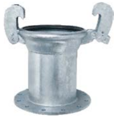
Female Socket x ANSI Flange