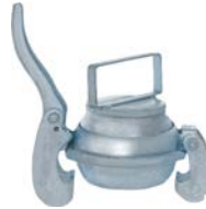
Male End Plug