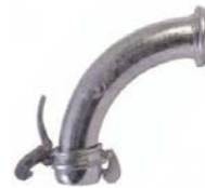
Male Ball x Female Socket 90°