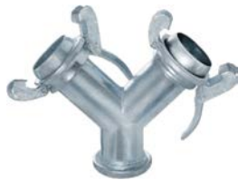
Double Male Ball - Y