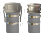
Camlock C X E