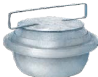
Male End Plug