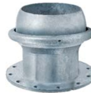
Male Ball x ANSI Flange