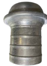
Male Ball x Shank