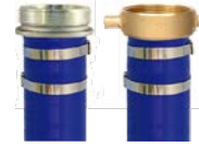
NPSH M x F